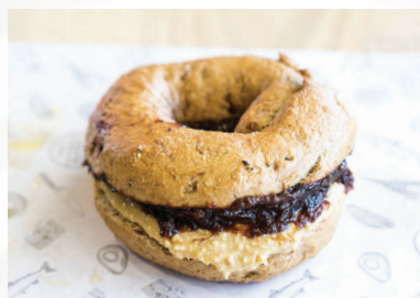
RAW PEANUT BUTTER $6 Add Jam $7 🌱