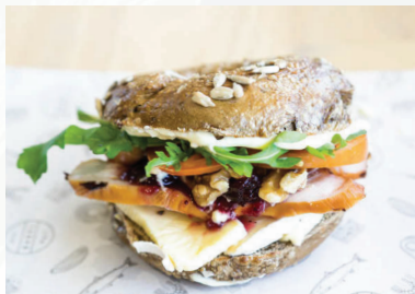
CHICKEN, BRIE & CRANBERRY $14.5 Smoked Chicken, Brie, Aioli, Toasted Walnuts, Tomato, Rocket 🌱