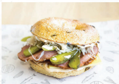
REUBEN $13.5 Pastrami, Swiss Cheese, Pickles, Sauerkraut, Russian Dressing 🌱