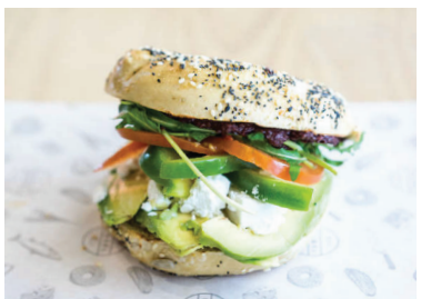
MEDITERRANEAN $13 Feta, Capsicum, Tomato, Olive Tapenade, Avocado, Rocket