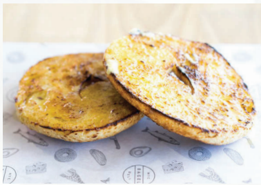
BUTTER $5 Cultured & Salted 🌱