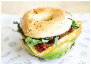
GRILLED HALLOUMI $14 Avocado, Sundried Tomatoes, Basil Pesto, Rocket, Fresh Lime Juice