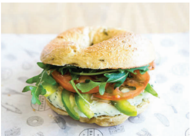
CREAM CHEESE & VEGGIES $11 Spring Onion & Dill Cream Cheese, Tomato, Capsicum, Rocket 🌱 🌱