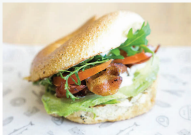
B.R.A.T. $14 Bacon, Rocket, Avocado, Tomato, Aioli