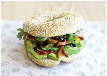
VEGAN $11 Avocado, Capsicum, Tomato, Sundried Tomato, Cucumber, Rocket, Balsamic reduction 🌱