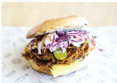
12 HOUR PULLED PORK $14.5 Swiss Cheese, Pickles, Apple Slaw 🌱