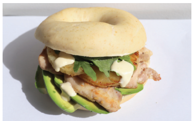
GRILLED CHICKEN & AVO $15 Grilled chicken, Avo, Grilled Pineapple, Aioli, Rocket

NUTRITIONAL KEY ALL BAGELS, EXCEPT GLUTEN FREE, ARE VEGAN