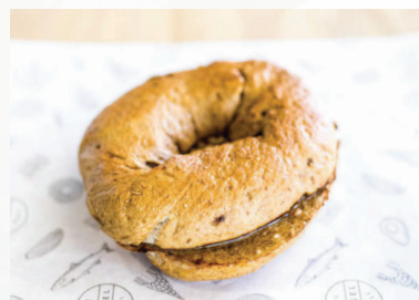
SPREADS $6 Plum Jam Honey Citrus Marmalade Nutella Vegemite