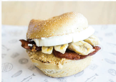
ELVIS "THE KING" $12 Bacon, Peanut Butter, Banana, Cream Cheese 🌱