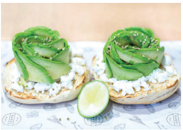
FETA & AVO ROSE $16 Crumbed Danish Fetta, Avocado Rose, Dukkah, Fresh Lime Juice (served open) 🌱