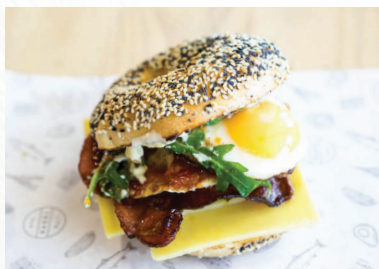
BREKKY BAGEL $14.5 Bacon, 2 Eggs 'Over Easy', Swiss Cheese, Tomato Chutney, Aioli, Rocket 🌱