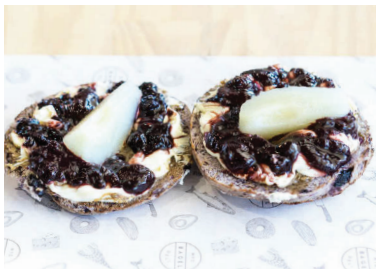
SWEET TOOTH BAGEL $13 Espresso Butter, Cream Cheese, Poached Pear, Berry Compote (served open)