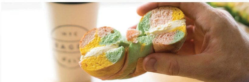
CREAM CHEESE SHMEAR $7 Plain Spring Onion & Dill Plain + Raw Organic Honey Plain + Plum Jam