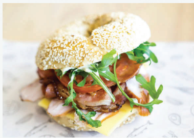
CLUB $15 Smoked Chicken Breast, Bacon, Tomato, Aioli, Swiss Cheese, Rocket 🌱